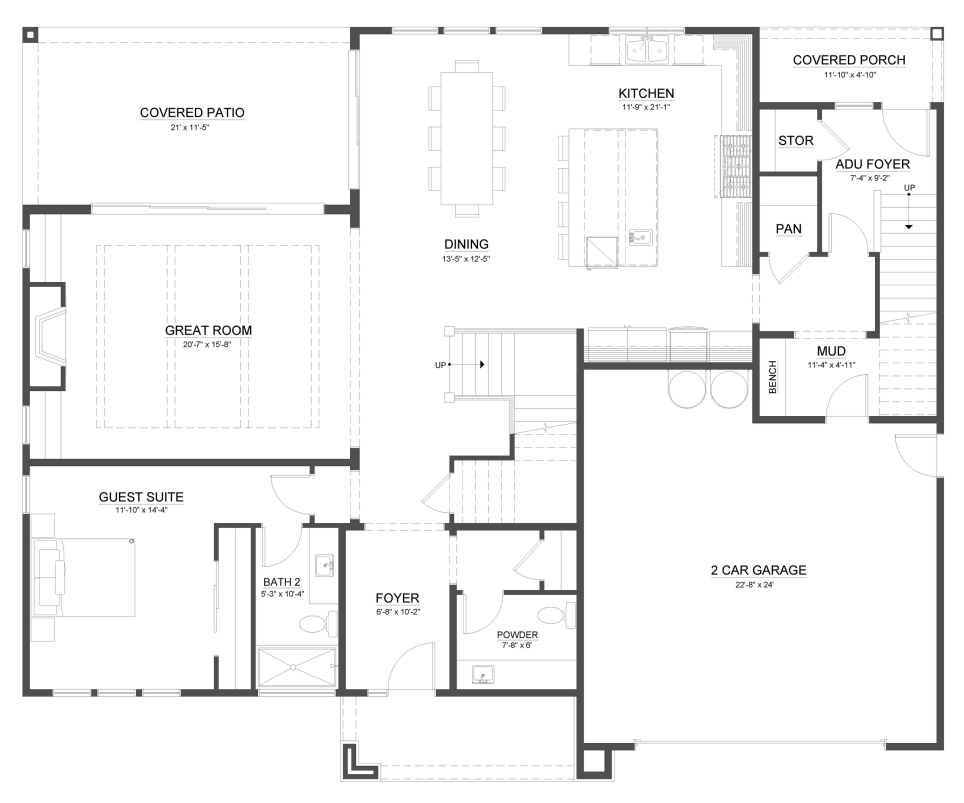
3,965 SF | 5 beds | 4 baths | 2 car garage | 2 story